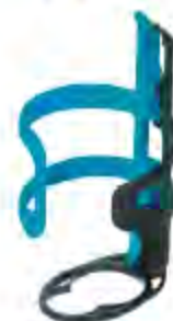
GBC-069 Material : plastic raw color the special design to change 3 pieces by an "8" plastic part recommend for standard bottle and pet bottle color: blue / red