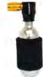
GHT-147 Co2 Tire inflators