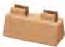
GHT-151 Made out of rice husks, An agricultural waste product. Can protect fork and your travel bag For 15mm through axles. Size : 97*45*45mm.