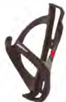
GBC-078 Material : Plastic Color : Black / White