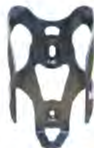
GBC-057 Material : Alloy