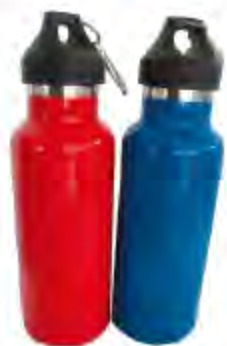
GBC-055/GBC-055-1 Material : 304 Stainless Steel Capacity : GBC-055: 350 c.c GBC-055-1: 600 c.c