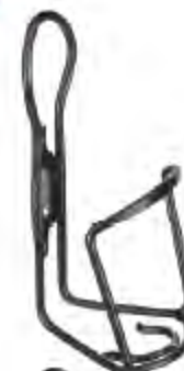
GBC-067 Material : Alloy