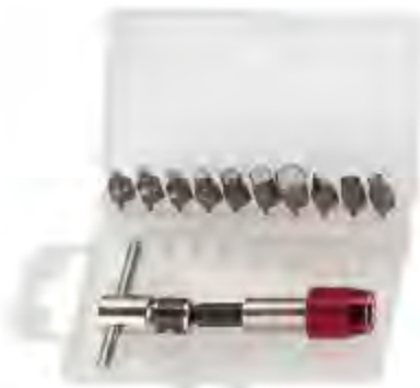
GHT-156 12-PC T-bit set