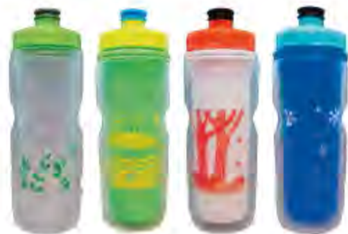
GBC-070 Capacity : 450 c.c. Mini TPR Nozzle(Mouth) Material : PP