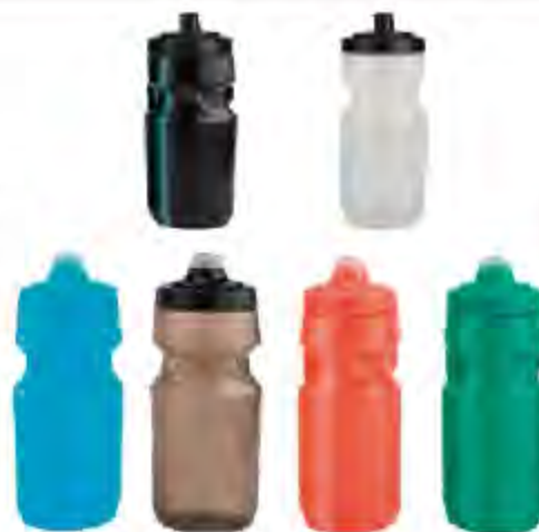
GBC-072 Capacity : 750cc Material : PE