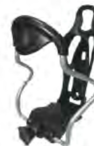
GBC-071 Available 350ml ~ 1000ml All bottle size are available Material : Adjustable Cage