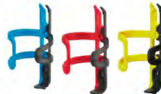
GBC-068 Material : plastic the special designed to change right or left load by an "L" plastic part color: blue / red / yellow