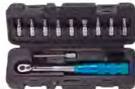
GHT-167 1/4" DR. Adjustable Torque Wrench, CP w/ Alu. handle, blow molded case, Spec.: 2-24Nm, hex3/4/5/6/8/10/T20/T25/T30 socket bits and 5mm L extension Accuracy is within ±4% Multifunctional Chain splitter w/DP-02 driving pin for 7-13 speed chain