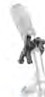
GBC-058 Plastic Cage Adapter φ22.2mm~φ31.8mm adjust vertical or lateral direction when it fits on the handle bar or stem