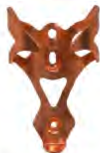
GBC-056 Material : Alloy