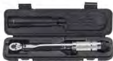
GHT-155 1/4" DR adjustable torque wrench (5-25NM)