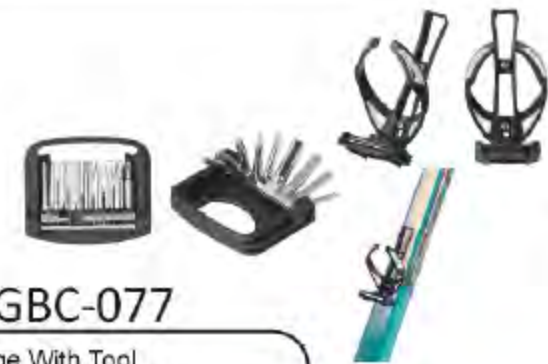
GBC-077 Bottle Cage With Tool Material : Nylon+Glass Fiber Color : Black / Red / Green / White