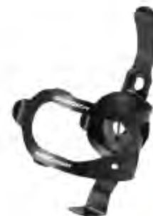
GBC-054 Double Side bottle cage Material : Alloy Color : Black / Silver