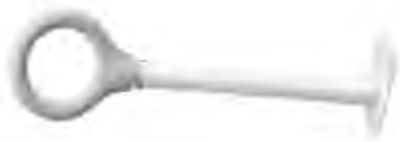
GHT-150 Speedy Parking Stand Wall Mount Color : Black / White