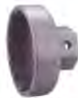
GHT-160 Bottom bracket tool For installing and removing the 12 notch external BB bearing , SRAM® DUB™, Race Face® Cinch™, Rotor® BSA30, Zipp® Vuma™, Hawk Racing ™ BB3086™