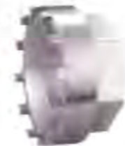
GHT-161 Crank Locking Tool For Rotor 3D+/3DF crank locking 30mm axle