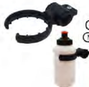
GBC-061 Material : PP