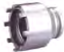
GHT-159-1 For E-Bike Tool Counter-ring Tool For Bosch Active Plus System